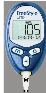
FreeStyle Lite Compact and portable. Perfect for on-the-go testing.